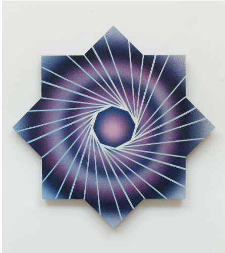
Mary Anna Pomonis Isis Anima , 2022 Acrylic airbrush on laser-cut plywood, wood 17 1/2 x 17 1/2 x 1 1/2 inches