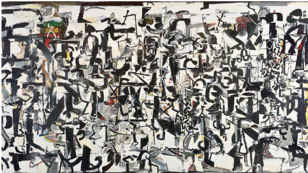
America: The New Alphabet, 2017, acrylic on canvas, 79 x 140 in

IN DISCUSSING the work of the Ethiopian-born artist Wosene Worke Kosrof, the phrase “visual language” can be taken literally. Kosrof’s most important body of work consists of paintings in which the characters used to write Ethiopia’s Amharic language are the central graphic element. Cohabiting on the canvas with simple geometric forms and fields of color, the Amharic characters create a dynamic, logic-challenging, visually fascinating abstraction.