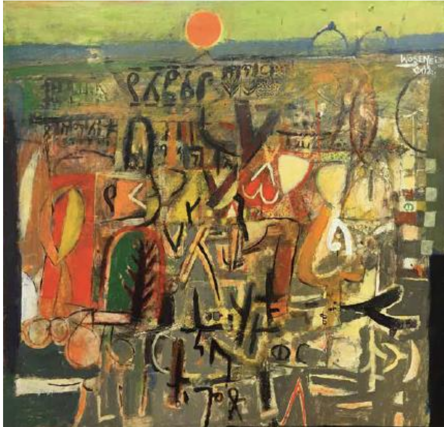
Love IV, 2005, acrylic on linen, 19.75 x 20.5 in.

Amharic may believe, incorrectly, that they can reduce the meaning of the painting to the meaning of the words, or else may be flummoxed trying to relate the one to the other. On the other hand, those to whom the script is unknown can appreciate its graphic possibilities and relish the mystery.