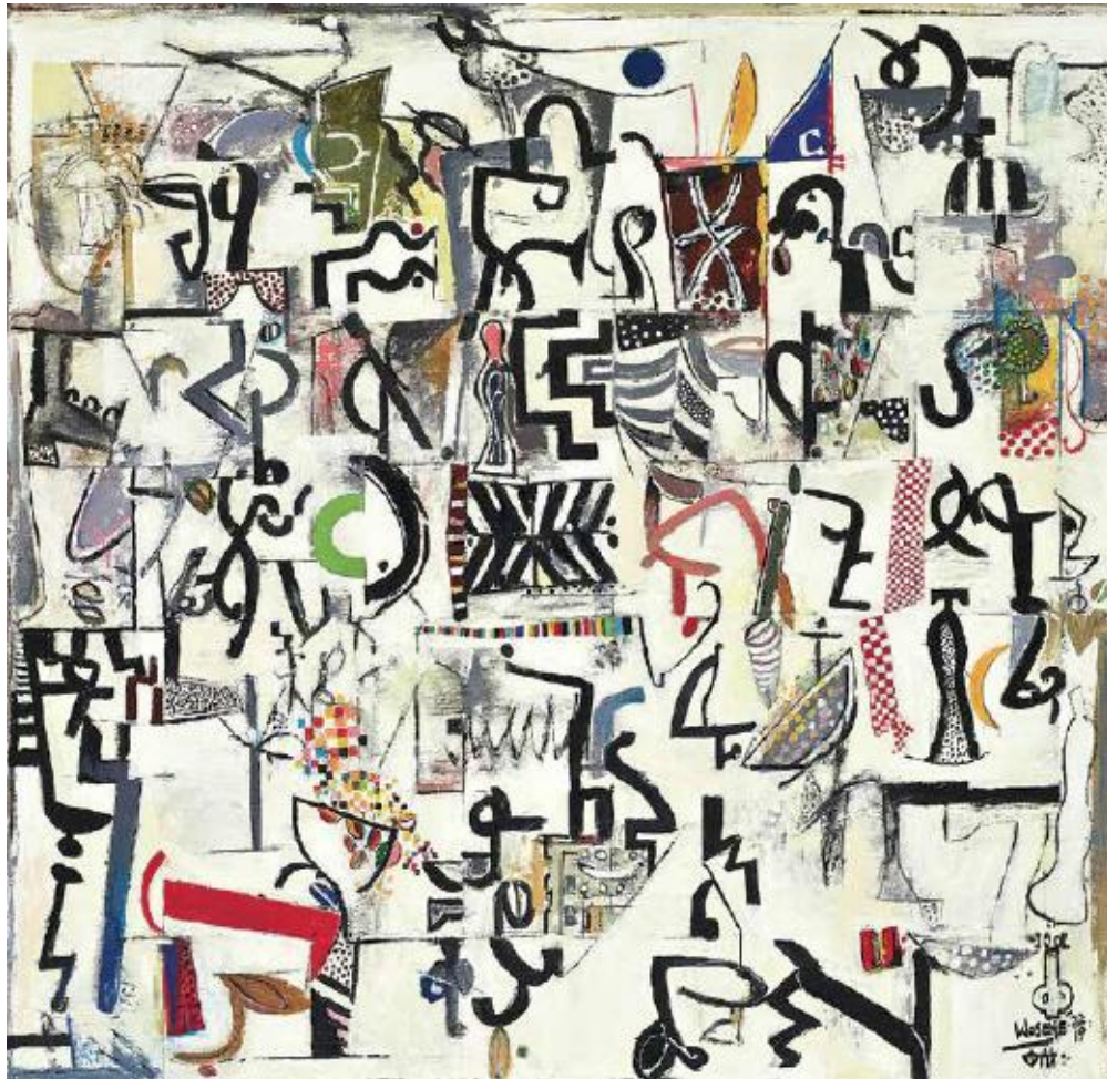
Coltrane, 2019, acrylic on linen, 38 x 36 in.

modernism from faculty members who had studied abroad, and at the same time absorbed traditional Ethiopian aesthetics, calligraphy, and Coptic Christian icon painting. Upon graduating with honors from SFA in 1972, he received an award directly from Emperor Haile Selassie and soon was exhibiting his work in Addis Ababa galleries. He also had paintings included in an exhibition in New York, "Africa Creates '72."