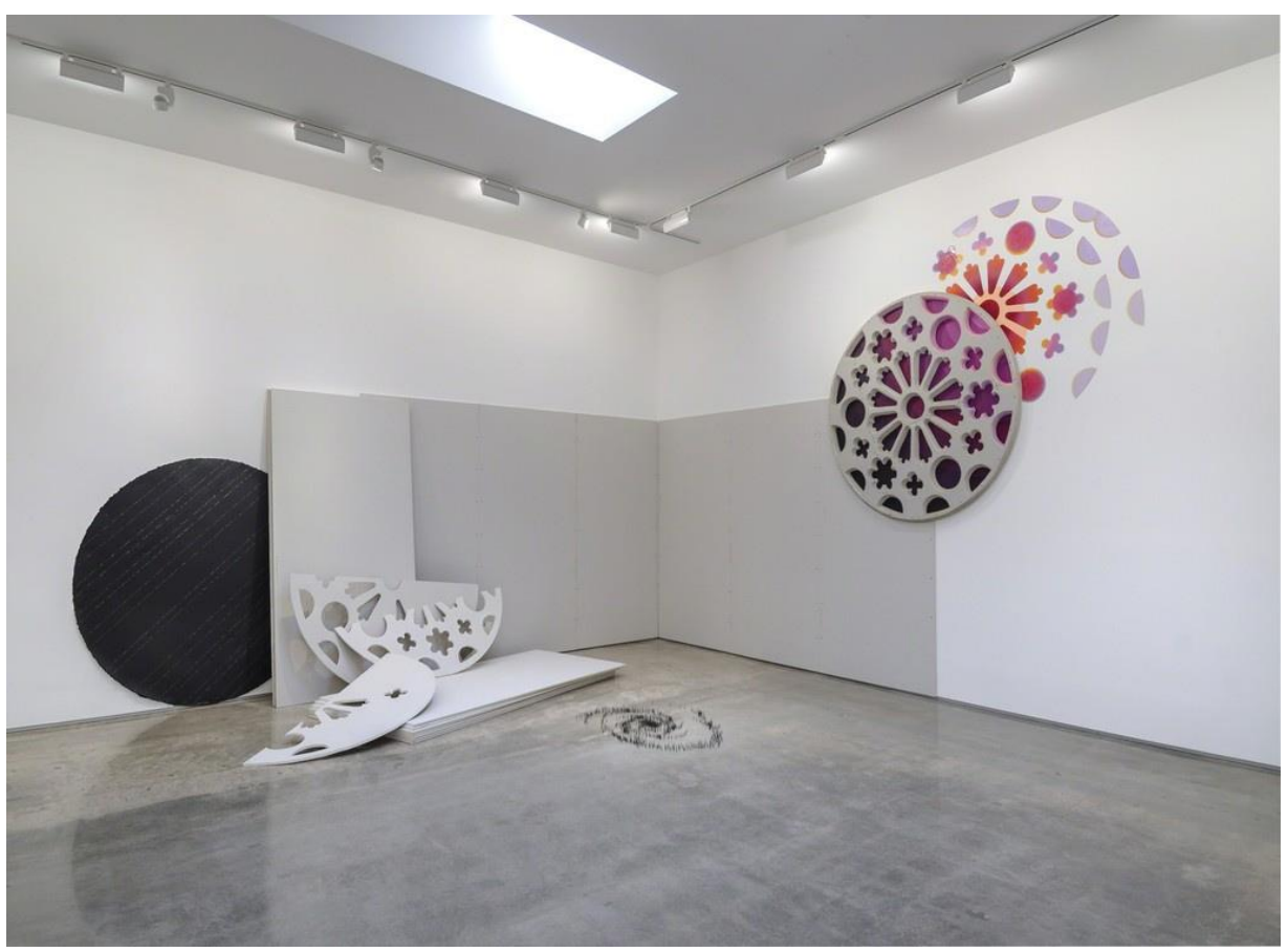
Installation "More Light Than Heat," on view at Edward Cella Art + Architecture, Los Angeles, 2015.