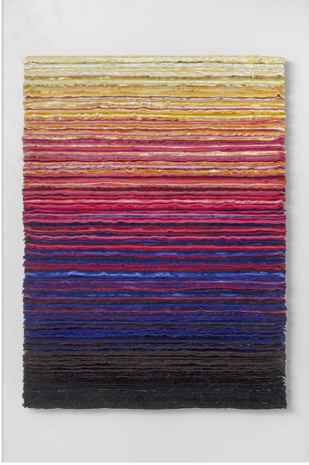
Lynn Aldrich The Universe in Captivity, 2015 Edward Cella Art and Architecture