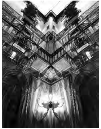
Patti Oleon, “Danielli,” 2017, oil on linen over hardwood panel, 55 1/2 x 42”.

When, though, do the works transcend fetishization? Most likely when they fully embody one of Oleon’s ongoing themes: deception, disorientation, and perhaps a touch